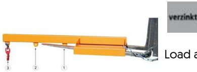
Load arm, galvanised